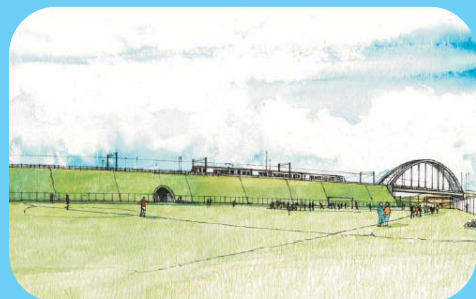
artist impression of embankment