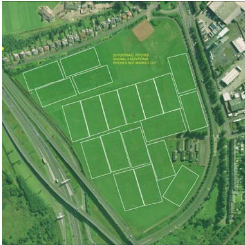
Current playing fields marked