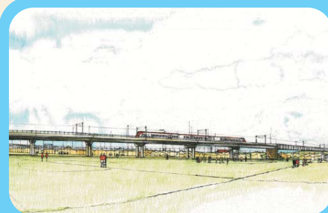
artist impression of viaduct

Forecast rail link usage: 850,000 in 2008, rising to 1.25 million in 2030