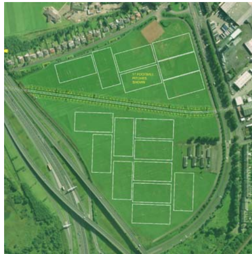
Revised markings if embankment is used