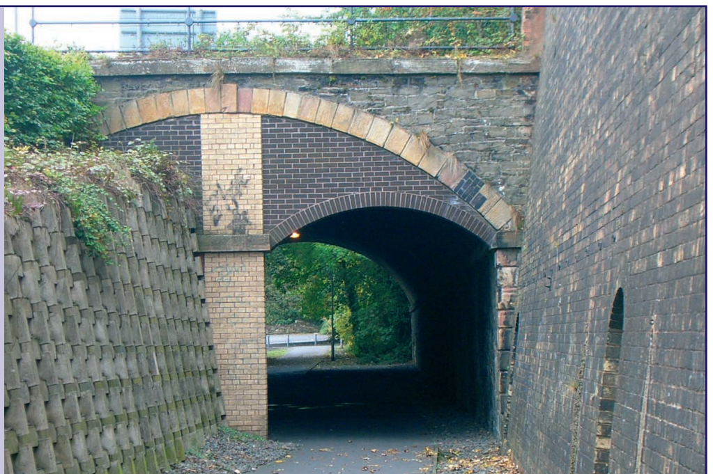
Ladhopevale, Galashiels, looking north: The new line will run along the existing footpath.