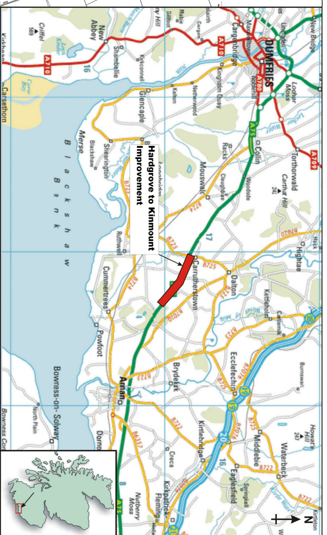
Location Plan (N.T.S.)

This map is based upon Ordnance Survey material with the permission of Ordnance Survey on behalf of the Controller of Her Majesty's Stationery Office © Crown copyright. Unauthorised reproduction infringes Crown copyright and may lead to prosecution or civil proceedings. Scottish Government, 100020340 2009.